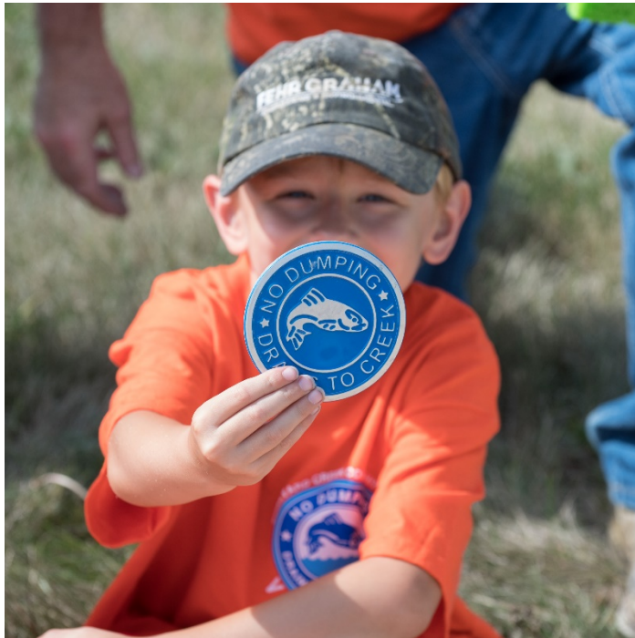
Volunteer Installs a Storm Drain Medallion