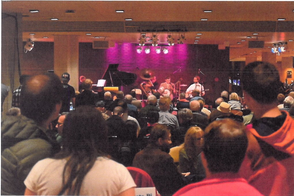
The Gaslight Squares, a traditional jazz band from St. Louis, kicked off the festival to an audience of about 350 people at the Krannert Center for the Performing Arts. 2019 C-U Folk and Roots Festival – Thursday, October 24, 2019