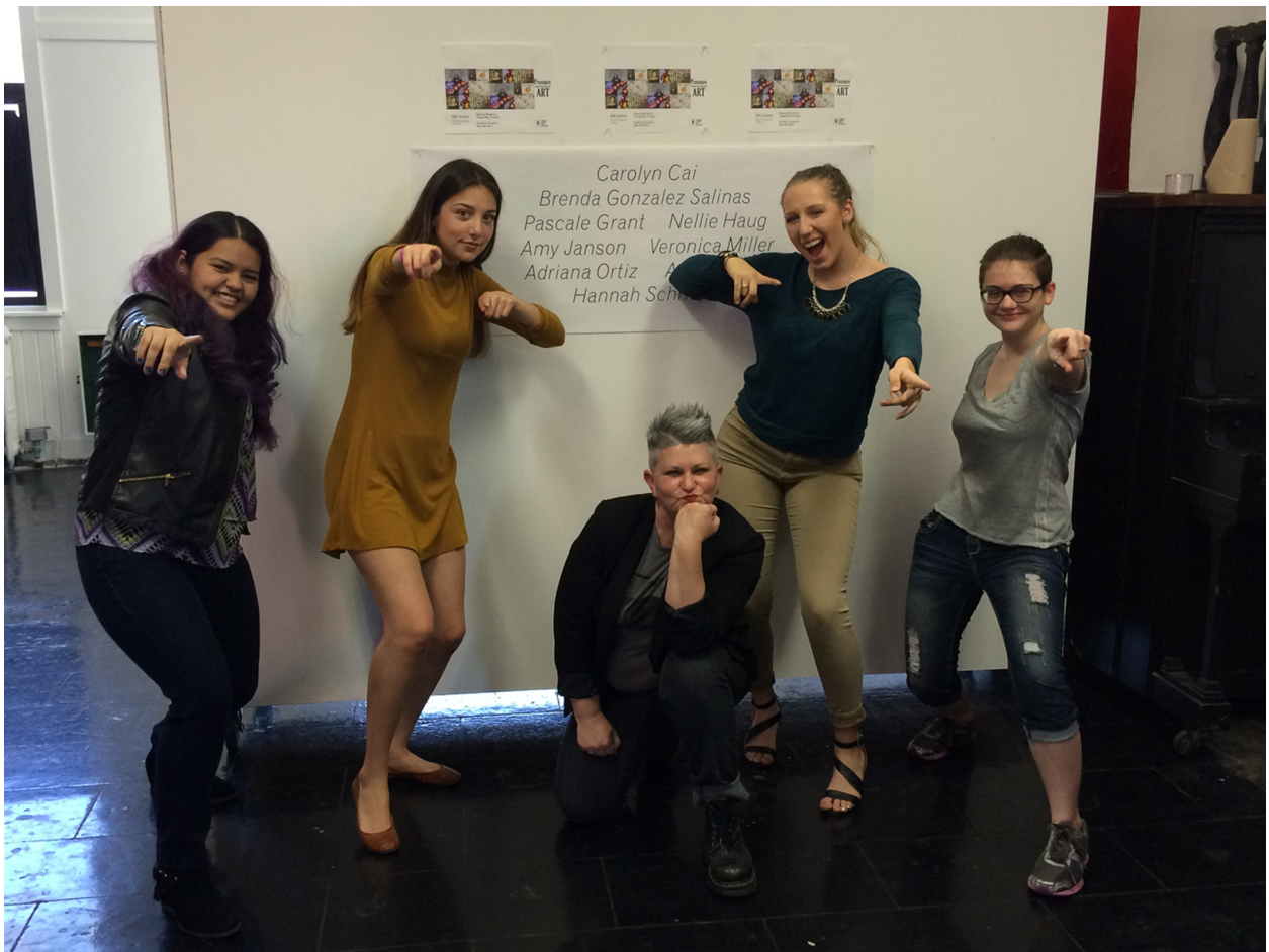
Centennial Highschool Students, Art Under Pressure