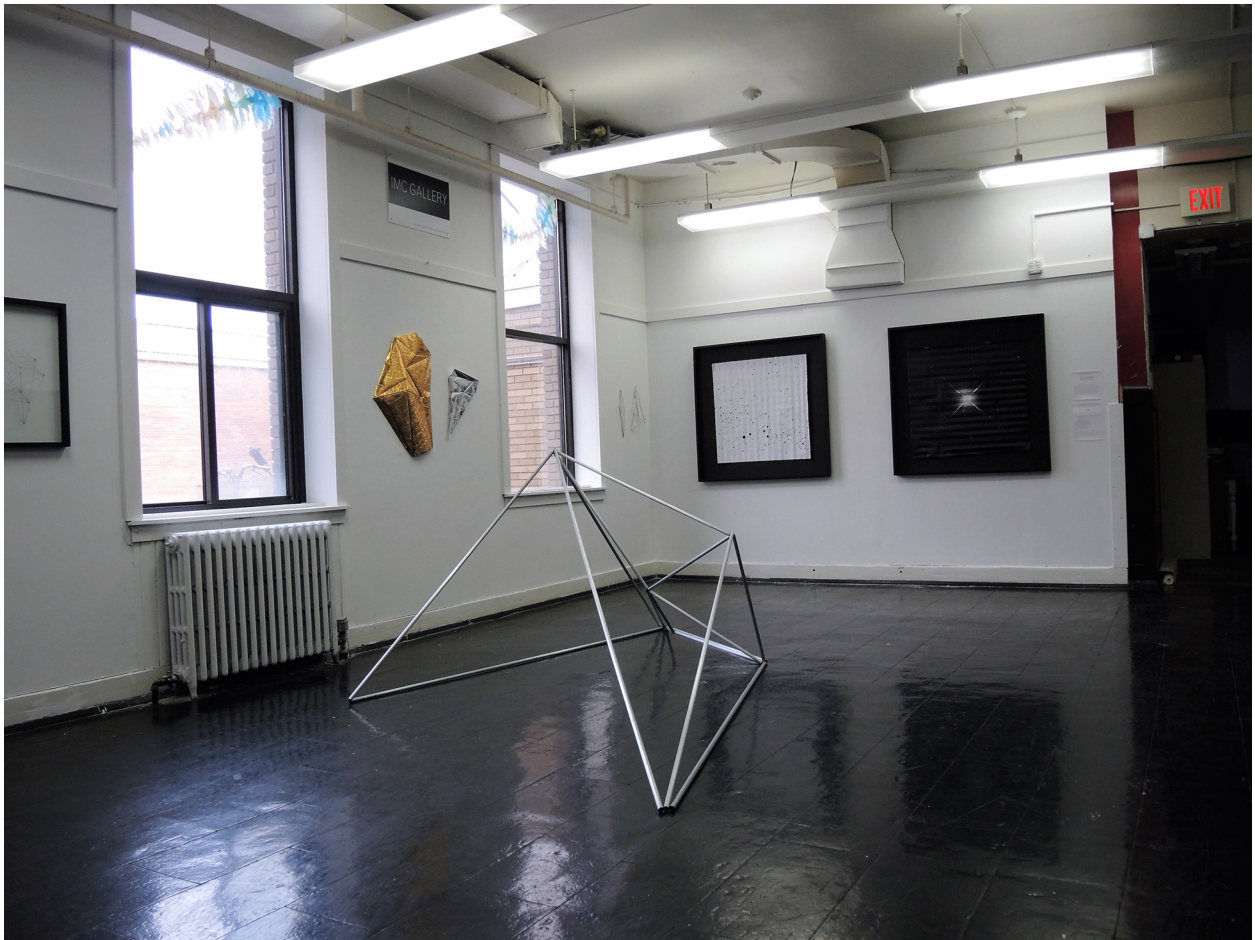
Travis Hocutt, Mapping Centaurus