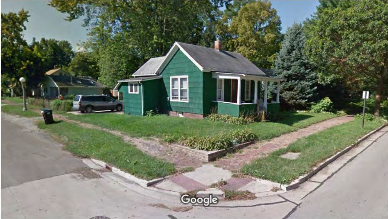
Picture of Brick Sidewalk on Anderson Street at Green Street looking South