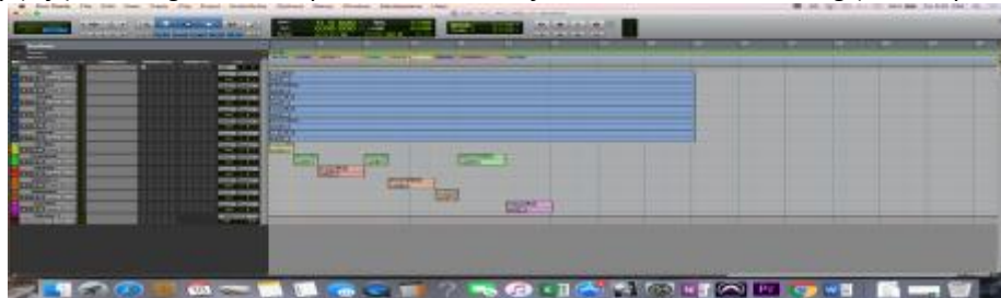
(AVID Pro Tools 12, Digital Audio workstation)