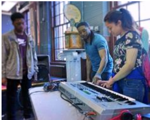
Photo courtesy of "The Miseducation of Hip Hop" youth workshop series, June 2016 at the IMC Building in Urbana, Illinois. Hosted by Mother Nature.