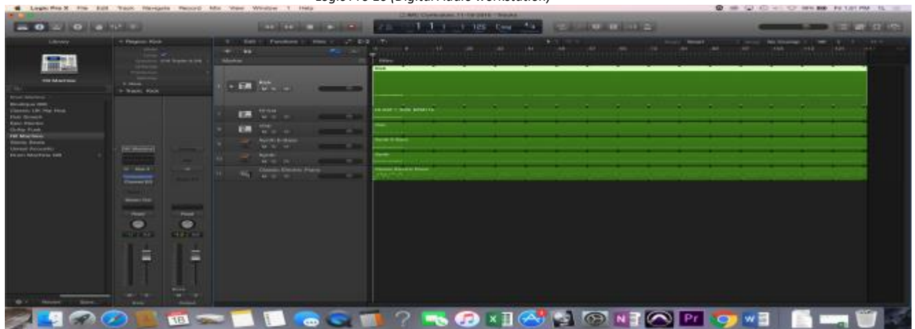
Logic Pro 10 (Digital Audio workstation)