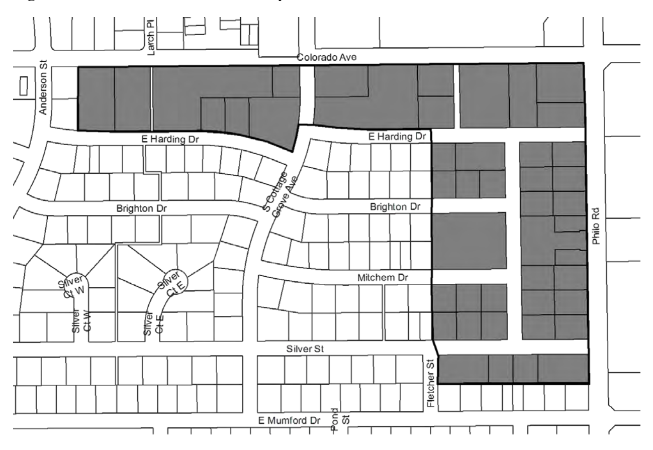
Figure XIII-1 Southeast Urbana Overlay District