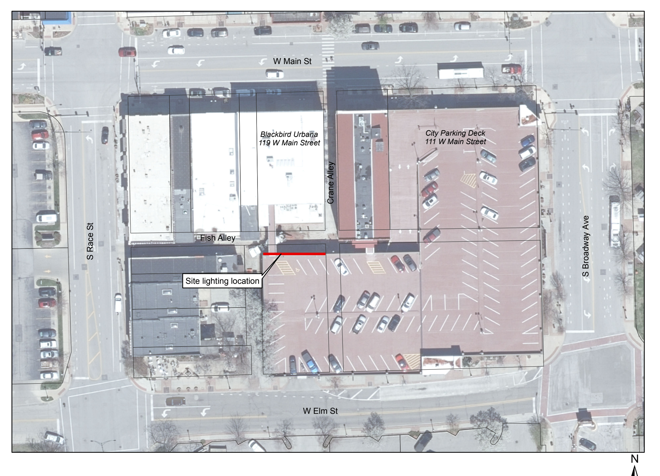
EXHIBIT A - LOCATION MAP