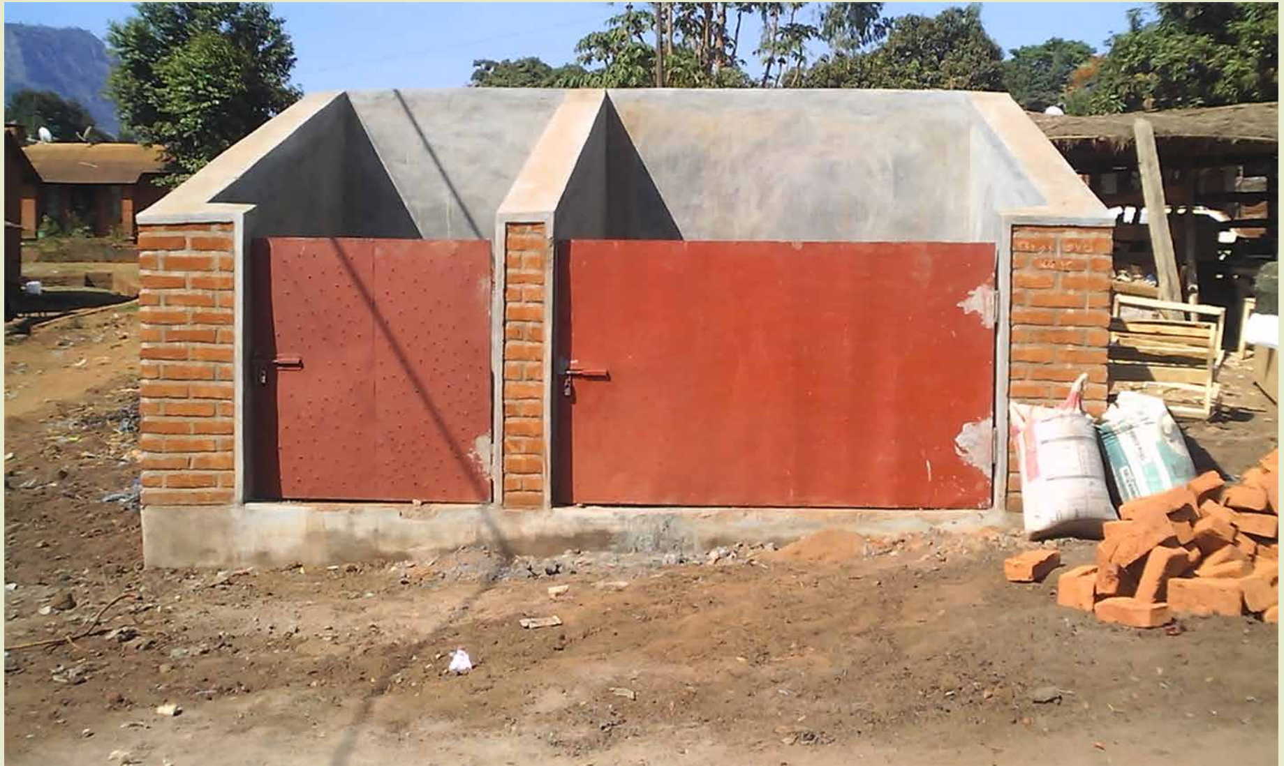
New trash bins are divided to collect solid waste and organic trash.