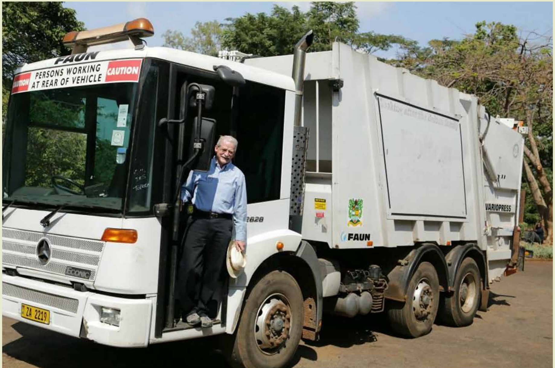
New garbage truck arrives in Zomba.