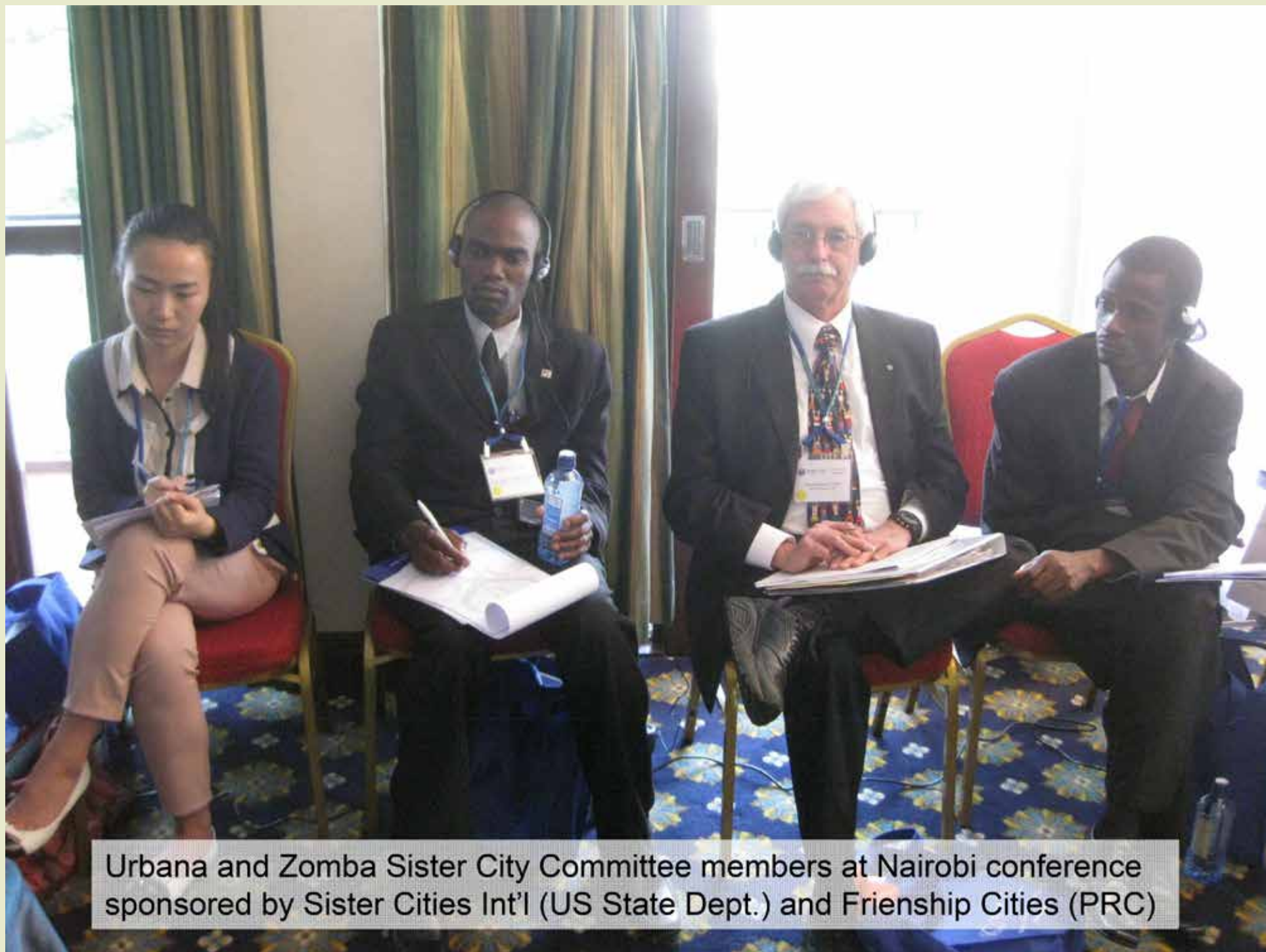
Urbana and Zomba Sister City Committee members at Nairobi conference sponsored by Sister Cities Int'l (US State Dept.) and Friendship Cities (PRC)