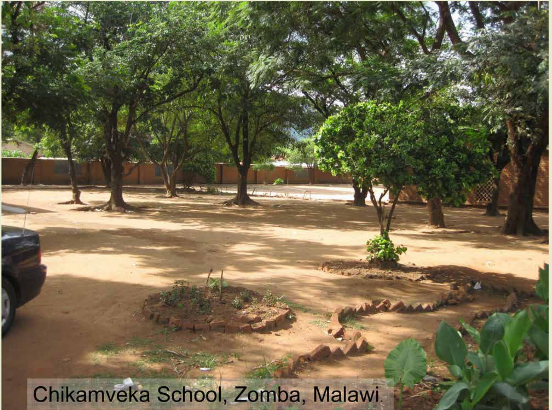
Chikamveka School, Zomba, Malawi.