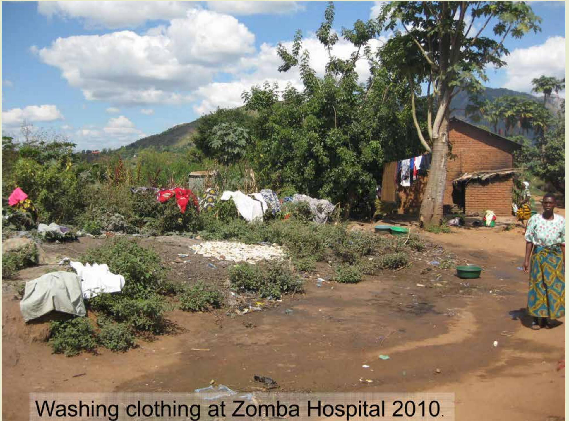
Washing clothing at Zomba Hospital 2010.