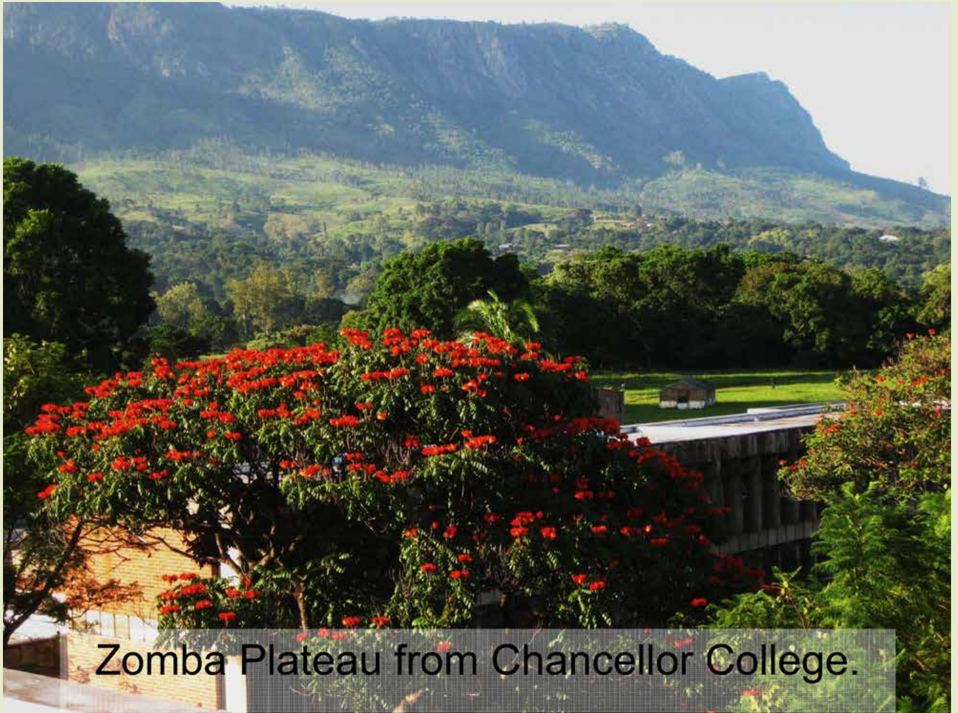
Zomba Plateau from Chancellor College.