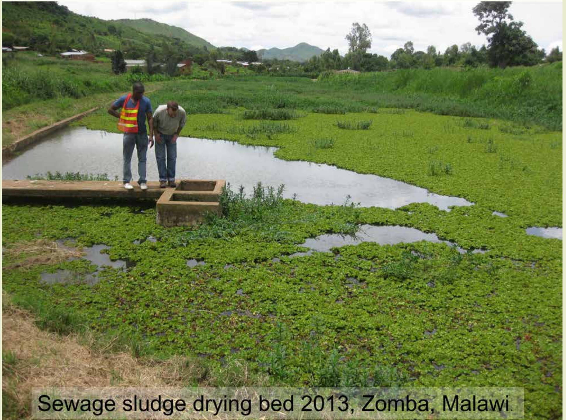
Sewage sludge drying bed 2013, Zomba, Malawi.