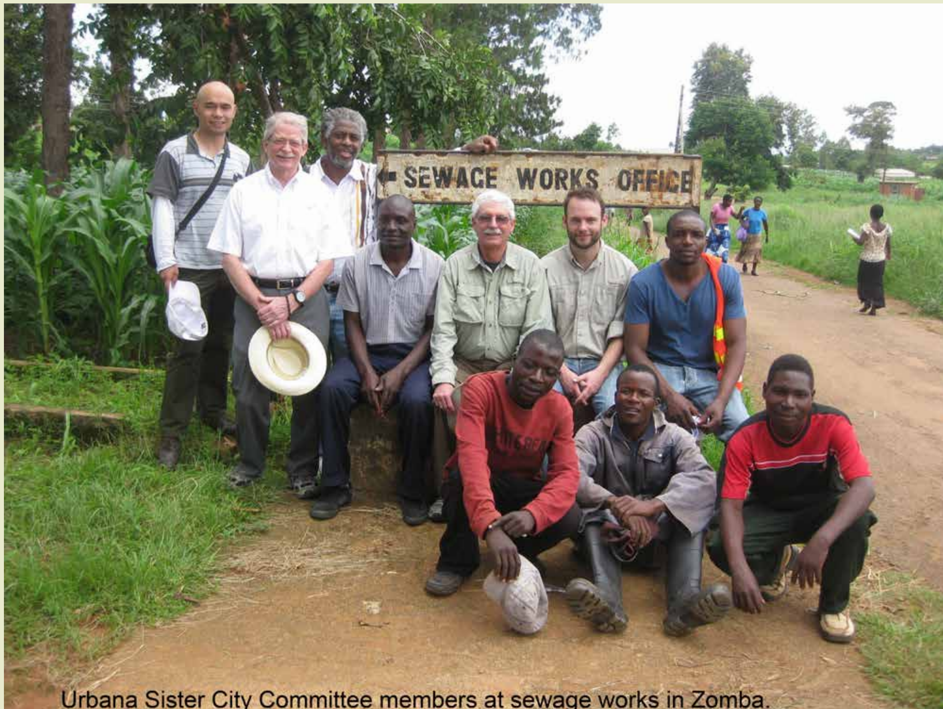
Urbana Sister City Committee members at sewage works in Zomba.