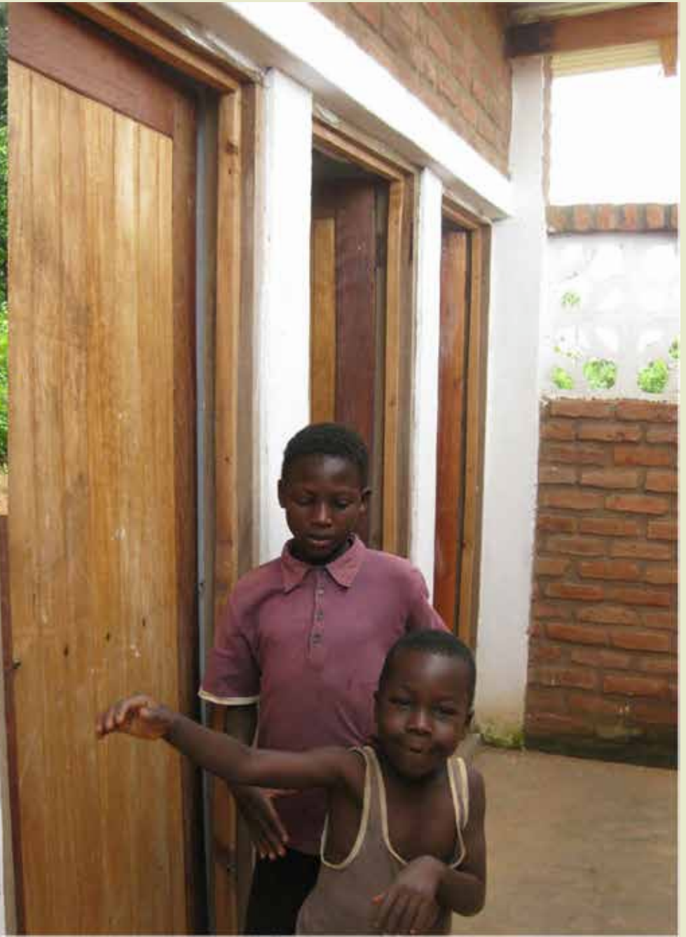
Toilets at Chalomwe school.