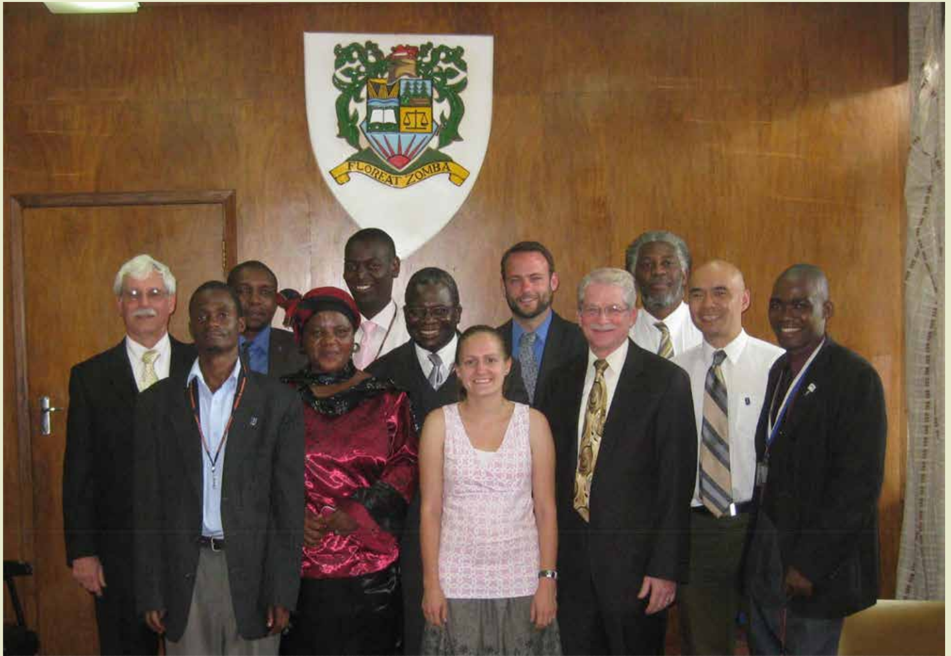
Sino-African Initiative Committee, Zomba, Malawi 2013.