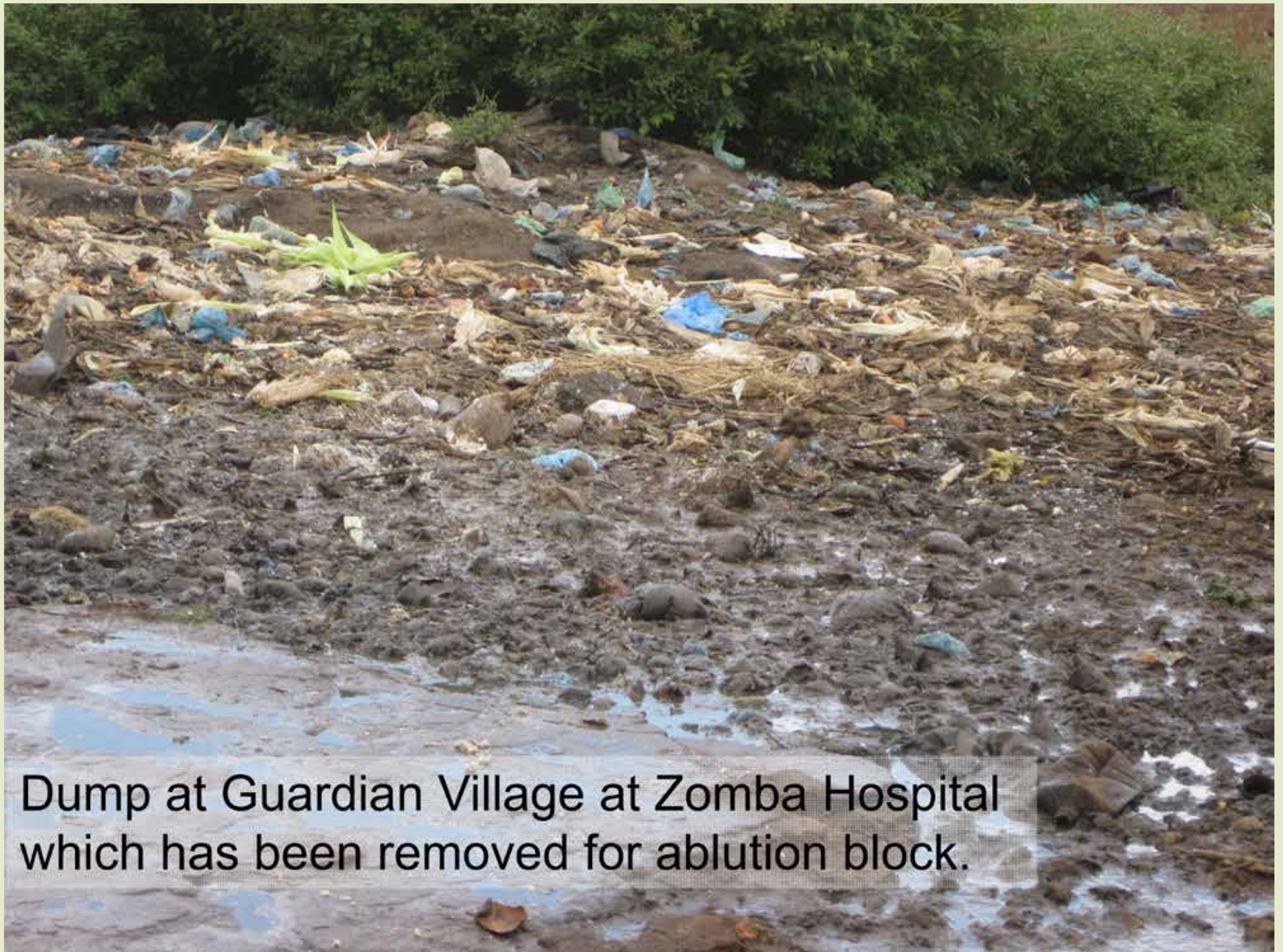
Dump at Guardian Village at Zomba Hospital which has been removed for ablution block.