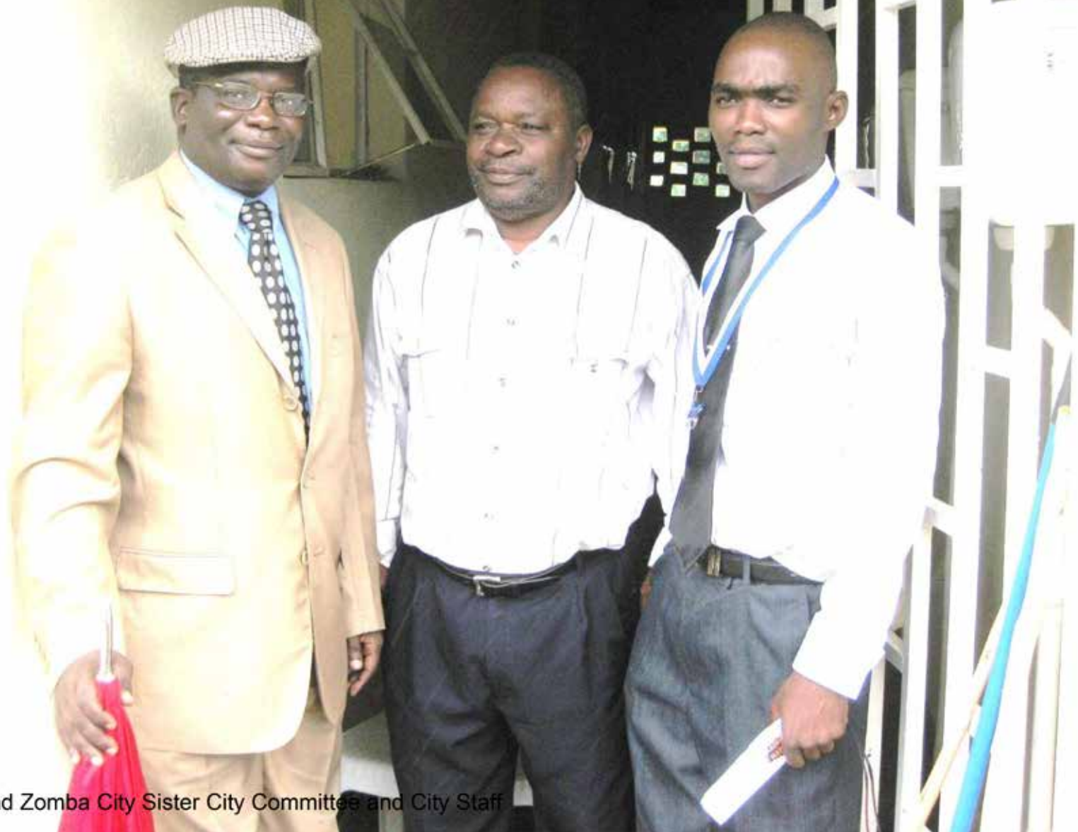
Urbana and Zomba City Sister City Committee and City Staff