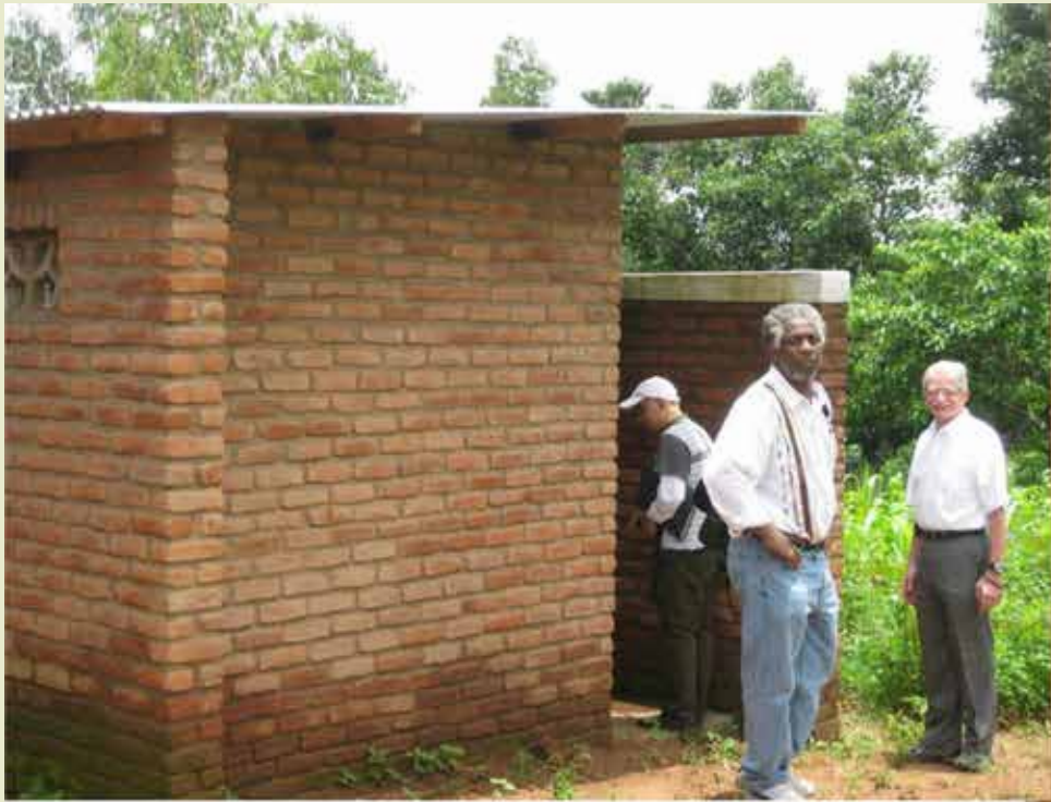
Toilets at Thundu school.