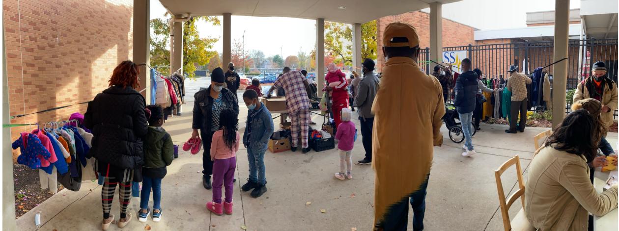
2021 Winter Coat giveaway.