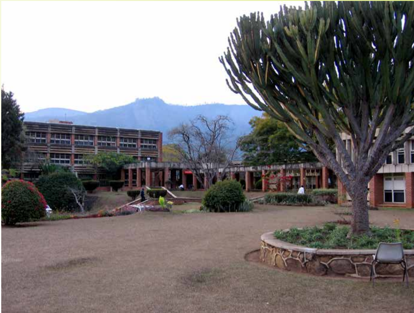
Chancellor's College Library, University of Malawi, Zomba.

City of Urbana Sister Cities Zomba, Malawi