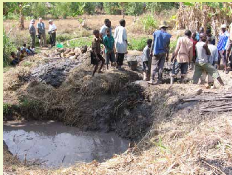
Water supply at a village without a clean water source, near Zomba.

Providing clean safe drinking water reduces sickness from cholera, and typhoid, reduces infant mortality, and improves the health of the entire village.