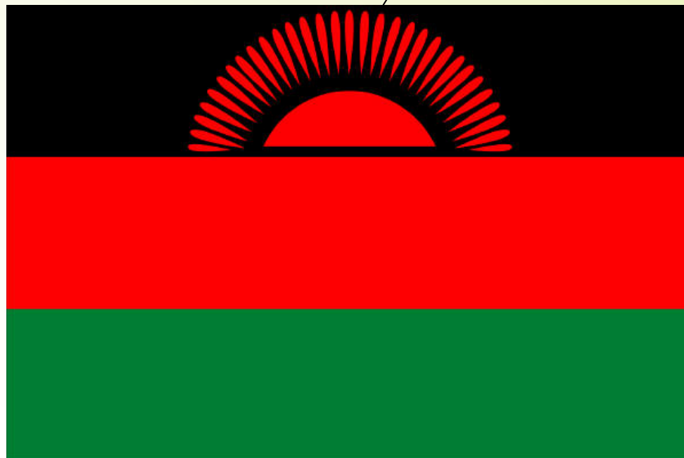
National Flag of Malawi

The rising sun represents the dawn of hope and freedom for Africa. The 31 rays of the sun represent Malawi as the 31 st independent African nation.