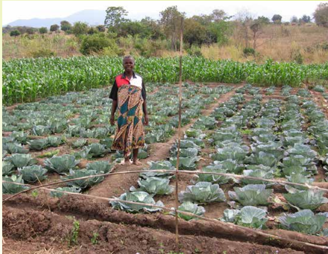
City of Urbana Sister Cities Zomba, Malawi