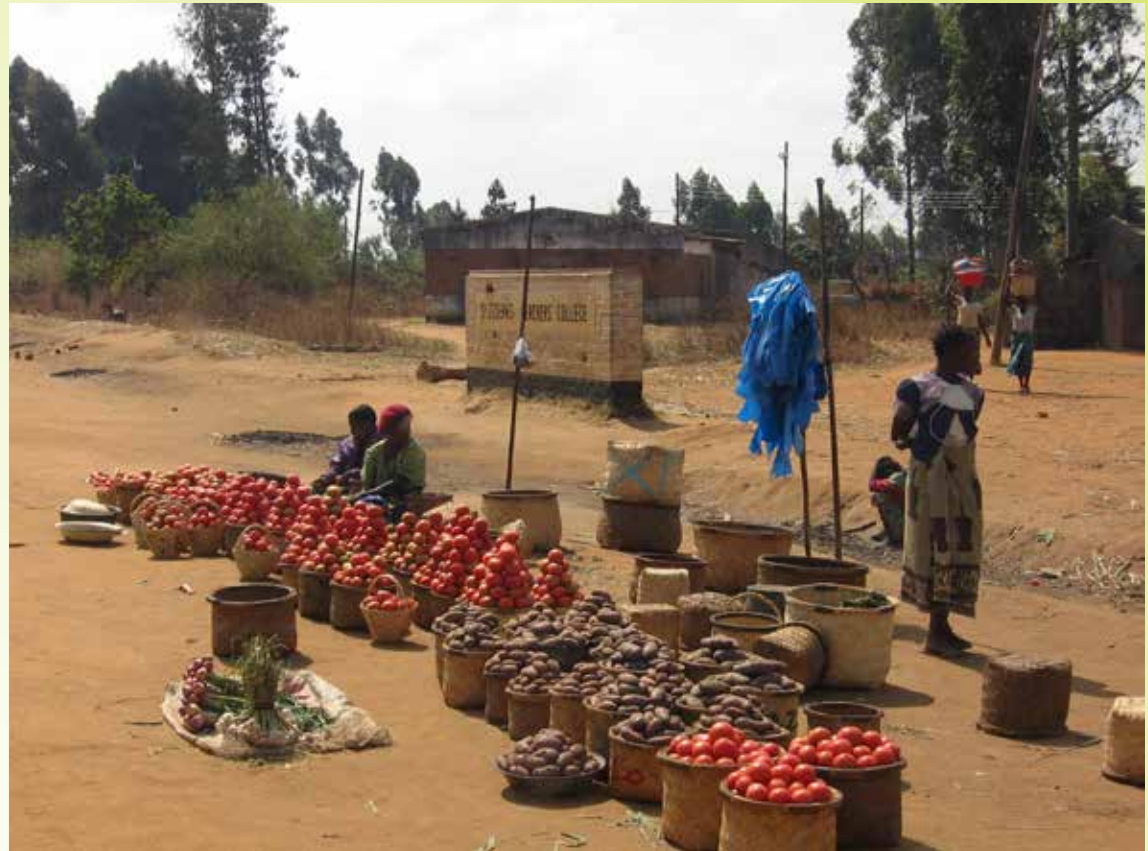
City of Urbana Sister Cities Zomba, Malawi