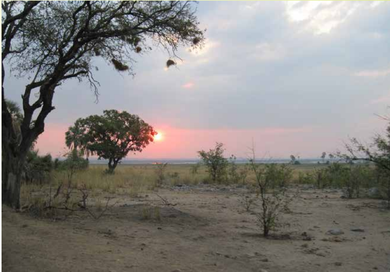
Sunset at Liwonde National Park, Malawi.

City of Urbana Sister Cities Zomba, Malawi