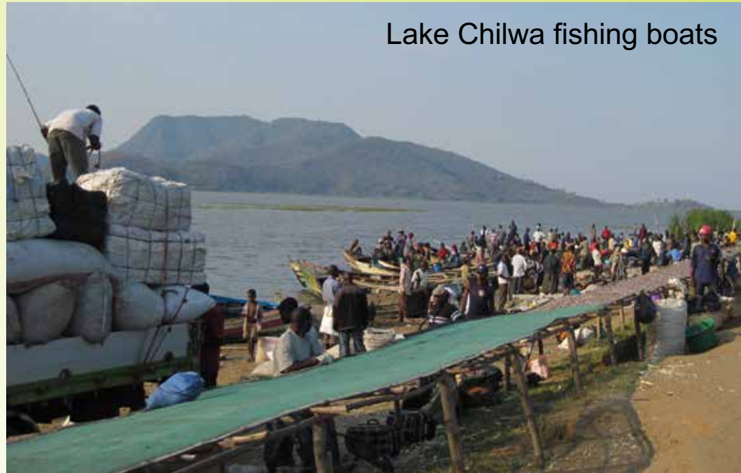
Lake Chilwa fishing boats

These are also caught in Lake Chilwa, 15 km east of Zomba.