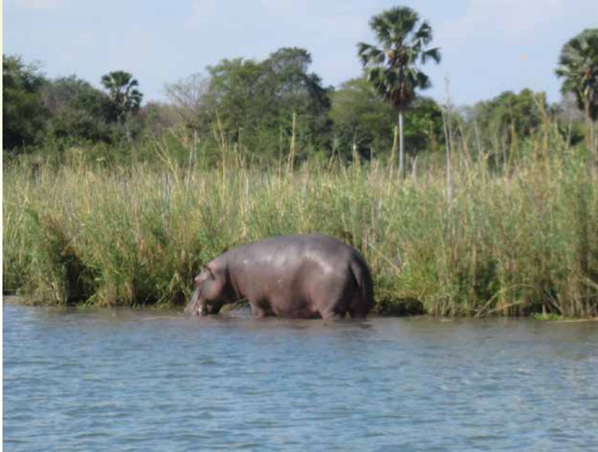
Hippo wading in the Shire River, Liwonde National Park, Malawi.

City of Urbana Sister Cities Zomba, Malawi