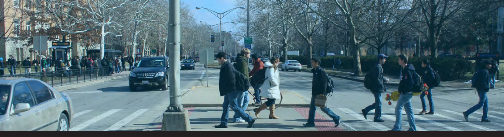
Project updates at: MCOREProject.com